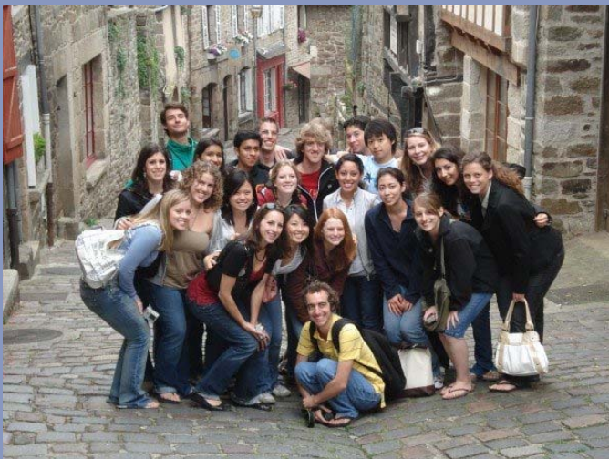
The group of students in the Summer Overseas Program 2007 in Paris, France.

Now, as I look back at the seven weeks I spent in Paris, I treasure my experience. Not only did I meet 28 wonderful people that have taught me countless life lessons, but I also learned that life has many twists and turns and that each, although some daunting, enhances my view of the world and shapes how I will live in it.