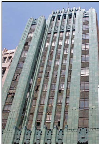
Left: The Jewelry Exchange in downtown Los Angeles has been an important landmark for tourists.