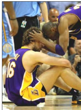
Pau Gasol, who injured his hamstring last season, will be back this week.