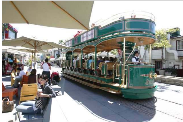
The trolley, a favorite ride at The Grove, is designed like an old-fashioned streetcar. The fountain show is also a must-see.

If you would like to see a movie, you can go to the Pacific Theatre. It has 14 theatres. You can choose recently movie here. It cannot be boring! Enjoy your life! You can go there by bus. It's not easy to go. First, just walk to Exposition and Figueroa Intersection. You can get on the bus No.550 toward West Hollywood.