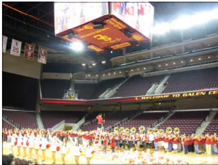
Home-coming Rally last Thursday, November 12. Cardinal and gold are the Trojan colors.

A typical Thanksgiving feast includes turkey, stuffing, mashed potatoes, yams, green beans, cranberry sauce, and for dessert, pumpkin pie and apple pie. Happy Thanksgiving!!