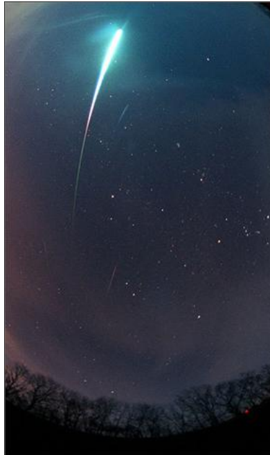
The Leonid Meteor Shower, which was visible on November 17, was created from by the comet Tempel-Tuttle. The name Leonid gets its name from the Constellation Leo.

I almost fell asleep when I was waiting for meteors. I thought I chose the wrong place to see the meteor shower. So, I decided to go back home.