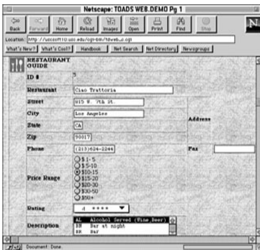
TOADS/Web Server makes forms easy to create.

Until the early 1990's, the Internet was a largely text-based file-sharing network for research scientists and academics. The development of HTML (Hyper Text Markup Language) showed that related files could actually be accessed easily, with a graphical interface. People quickly realized that with the ease of HTML, they could publish documents that could bring up related graphs, research data, and papers, and more importantly, access non-research items. As PCs and networks continued to become more powerful, sound and multimedia were added to the HTML