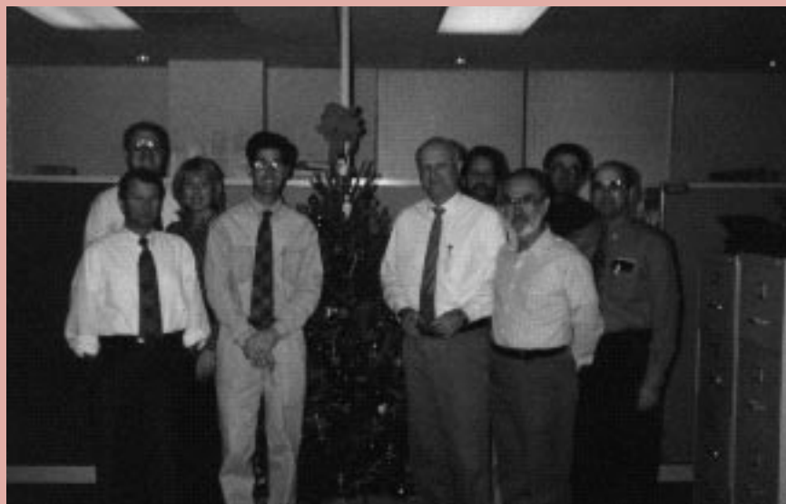
The DCC team: Committed to education computing solutions.