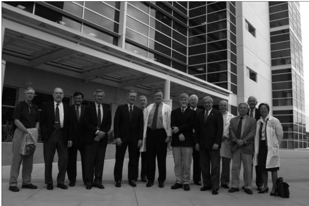
Keck School of Medicine department chairs toured the new HCC II building's offices and examination rooms on May 12 after a meeting to prepare the School for a transition in leadership.